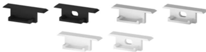
plastic end caps P6-2+C13