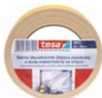
TESA adhesive tape